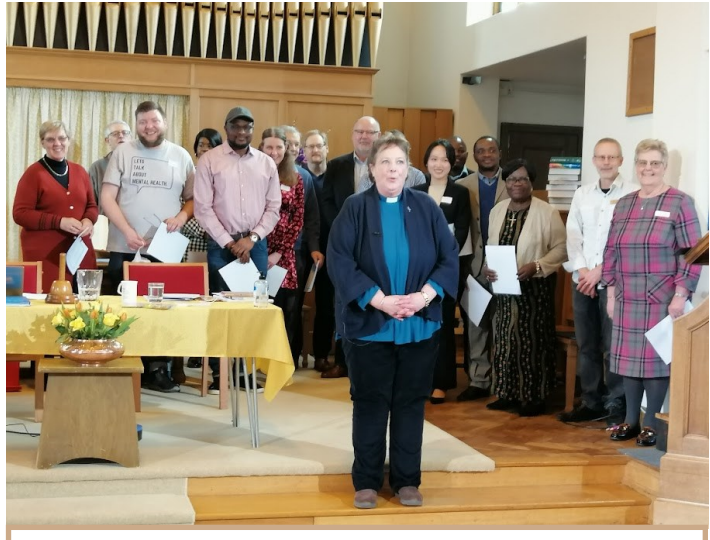
New Synod Recognised Lay Preachers being welcomed at Synod Together at our gathering in March, 2022.

Get your FREE tickets from https://bit.ly/TAAnyQuestions